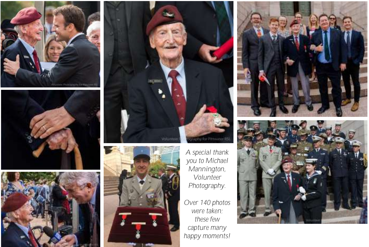
A special thank you to Michael Mannington, Volunteer Photography. Over 140 photos were taken; these few capture many happy moments!